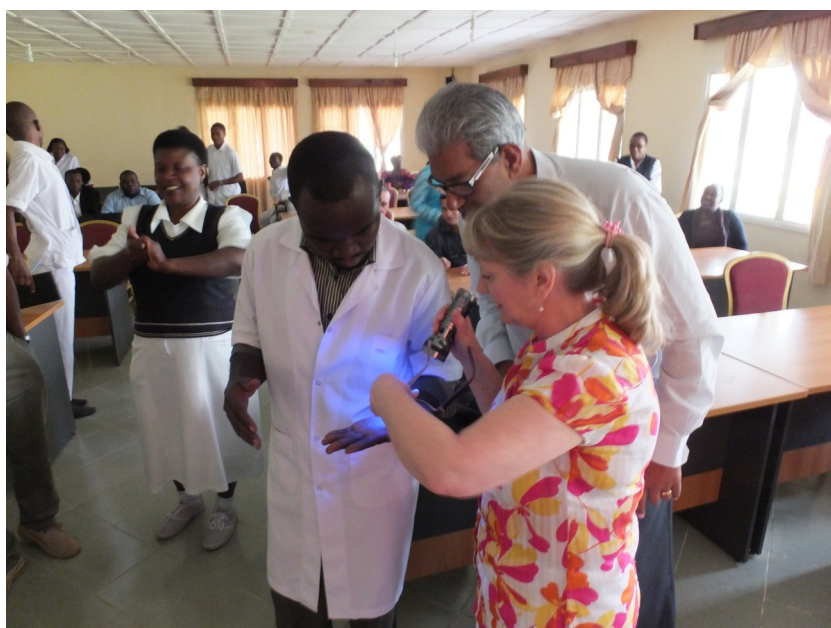
Partnership working in action at Mbeya during the recent visit

this was reflected in the medical and nursing staff perceptions of hand hygiene. Health-care workers surveyed generally had good knowledge of infection control principles. Clinicians were motivated to begin implementing the WHO Surgical Safety Checklist, as well as developing local antimicrobial guidelines (see the APPS News feature on antimicrobial resistance) and there was an opportunity for further training and discussion in these areas. The North Cumbria team thank their colleagues in Mbeya for their kind and generous hospitality during the visit and look forward to continuing the partnership.