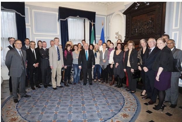
Participants in the EEA meeting , Dublin

The European ESTHER Alliance (EEA) met in Dublin in early December to share experiences and define strategic direction in 2014 and beyond. The cross-cutting nature of patient safety and quality was highlighted as a potential key thematic area of partnership work. Shams Syed provided an update on the new WHO Department of Service Delivery and Safety. Collaboration with multiple European partners on patient safety partnerships were explored, in particular the hosts Ireland. In fact, Joe Costello, the Irish Minister of State for Trade and Development, mentioned the collaborative efforts between ESTHER Ireland and African Partnerships for Patient Safety in his opening remarks. To find out more on EEA see http://www.esther.eu/