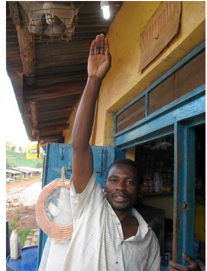
One of our first customers