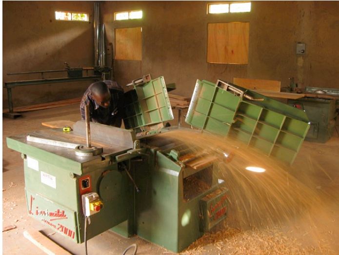
New wood machining workshop